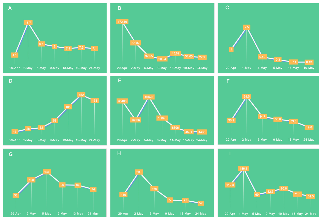
Figure 2 (A) The tendency of white blood cell value ( 10^9/L ) during hospital stays. (B) The tendency of high-sensitivity C-reactive protein value (mg/L) during hospital stays. (C) The tendency of procalcitonin value (ng/mL) during hospital stays. (D) The tendency of platelet value ( 10^9/L ) during hospital stays. (E) The tendency of D-dimer value ( \mu g/L ) during hospital stays. (F) The tendency of total bilirubin value ( \mu mol/L ) during hospital stays. (G) The tendency of alanine aminotransferase value (U/L) during hospital stays. (H) The tendency of aspartate aminotransferase value (U/L) during hospital stays. (I) The tendency of serum creatinine value ( \mu mol/L ) during hospital stays.

the species or the RPM (sample) / RPM (NC) \geq 5 , which was determined empirically according to previous studies as a cutoff for discriminating true-positives from background contaminations.